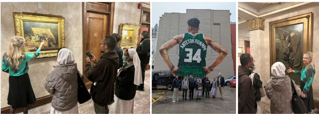
ECSP Milwaukee Outing