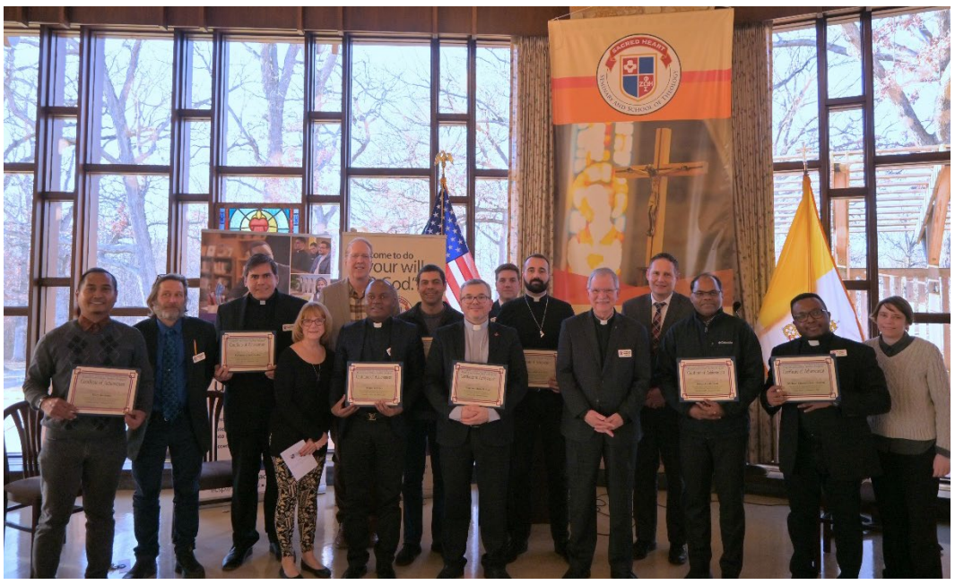
ECS Certificate Ceremony

On December 07, the English and Culture Studies Program (ECS) concluded its Fall II Session with a certificate ceremony. We are sad to say goodbye and hope that all the graduates will look back fondly on their time here at Sacred Heart. Congratulations to all the graduates!