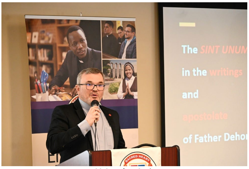
ECS Speaker Series

respective propaedeutic formators. To read the details of the sites they saw on their excursions click <u>here</u>.