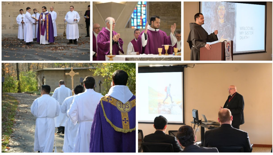
Day of Recollection