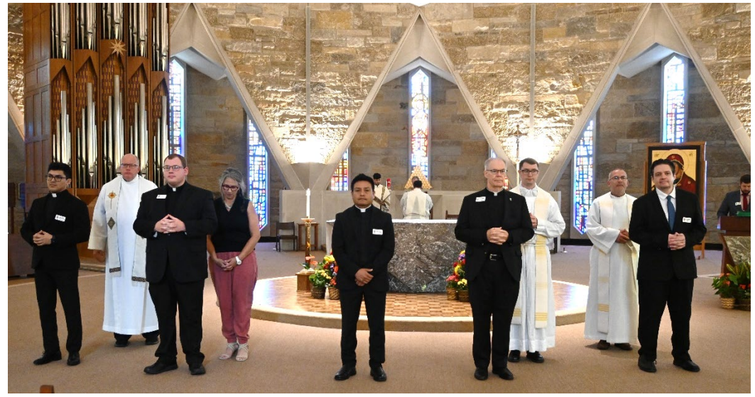
Rite of Commissioning Seminarians Involved in Pastoral Service