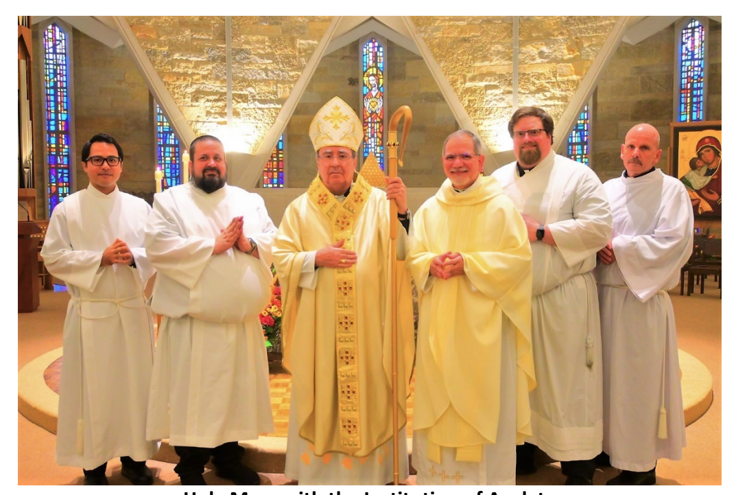
Holy Mass with the Institution of Acolyte

On Wednesday, October 26, the following men were instituted as Acolyte during Mass: