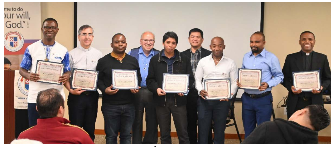
ECS Certificate Ceremony

To watch the lecture, click <u>here</u>.