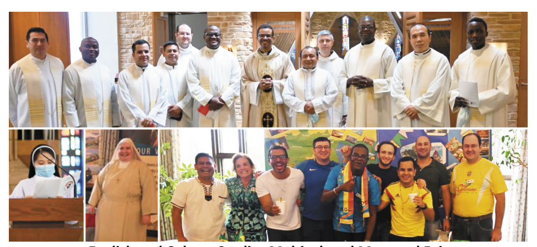
English and Culture Studies Multicultural Mass and Fair

On Wednesday, October 06, ECS students celebrated a multicultural mass. Sacred Heart is proud of the multicultural community who came together to engage in a multilingual mass, with liturgy, highlighting many traditions. Thirteen languages were spoken at the mass. To watch the mass, click <a href="here">here</a>. Additionally,