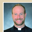
Sacred Heart sends forth men for their ordination to the priesthood PAGE 4