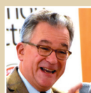
Fall Dehon Lecture draws international speakers PAGE 3